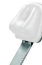
Elle E C2002 Bianco