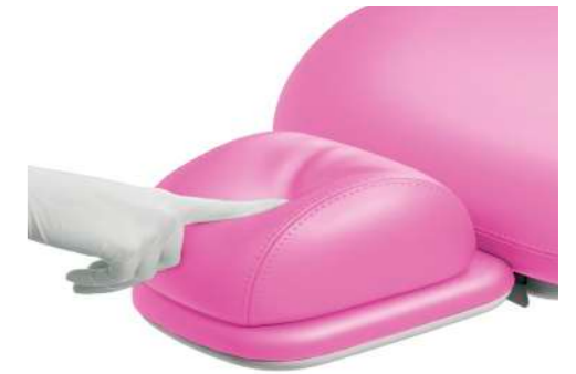
Soft Foam upholstery

The Soft Foam upholstery is also available.