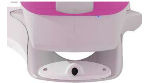
Joystick for the patient chair control.

Trendelenburg function (possibility of synchronous raising of the legs by 15° when lowering the chair backrest by 90°). Correct blood circulation is provided at such chair positioning during treatment.