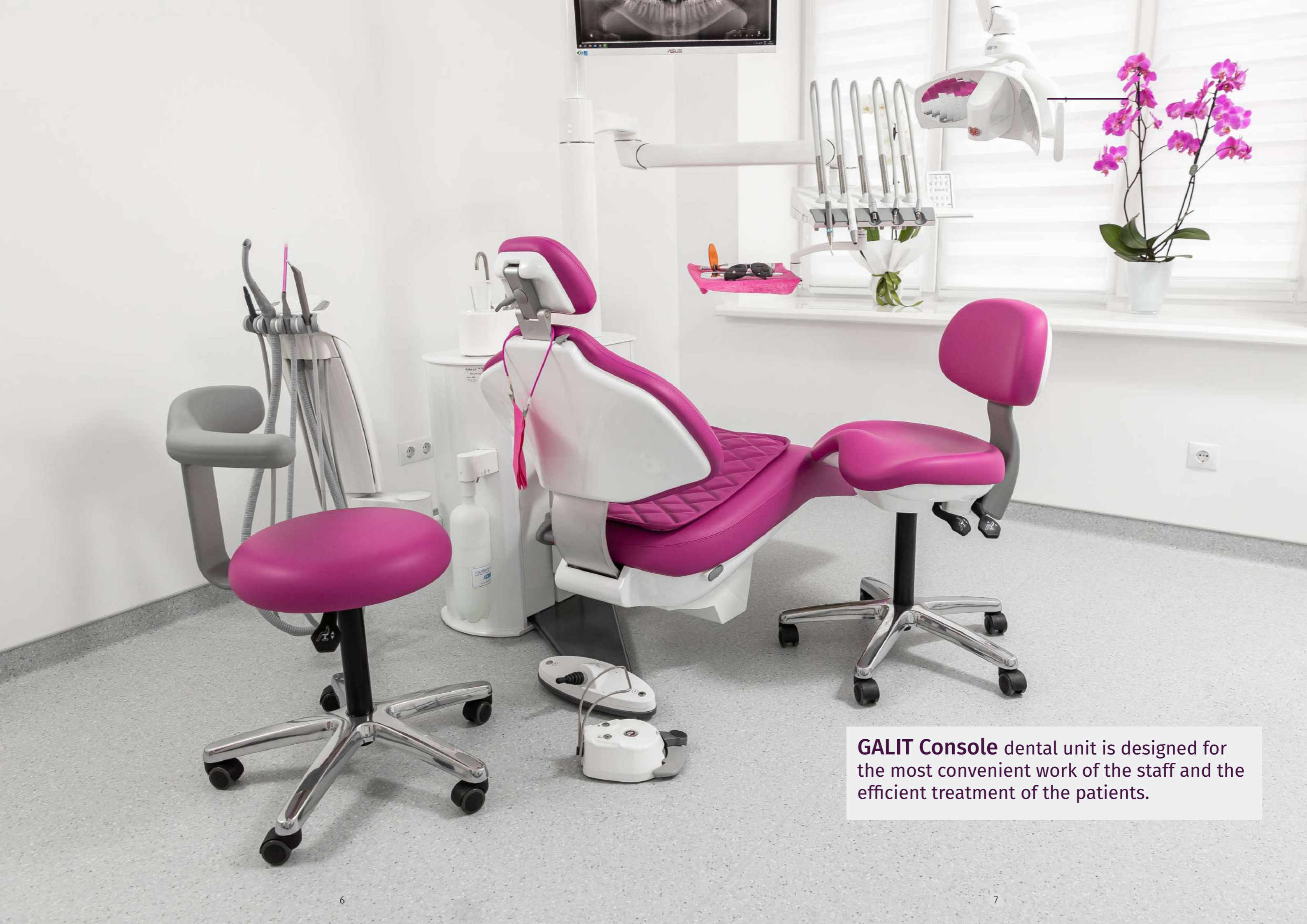
GALIT Console dental unit is designed for the most convenient work of the staff and the efficient treatment of the patients.