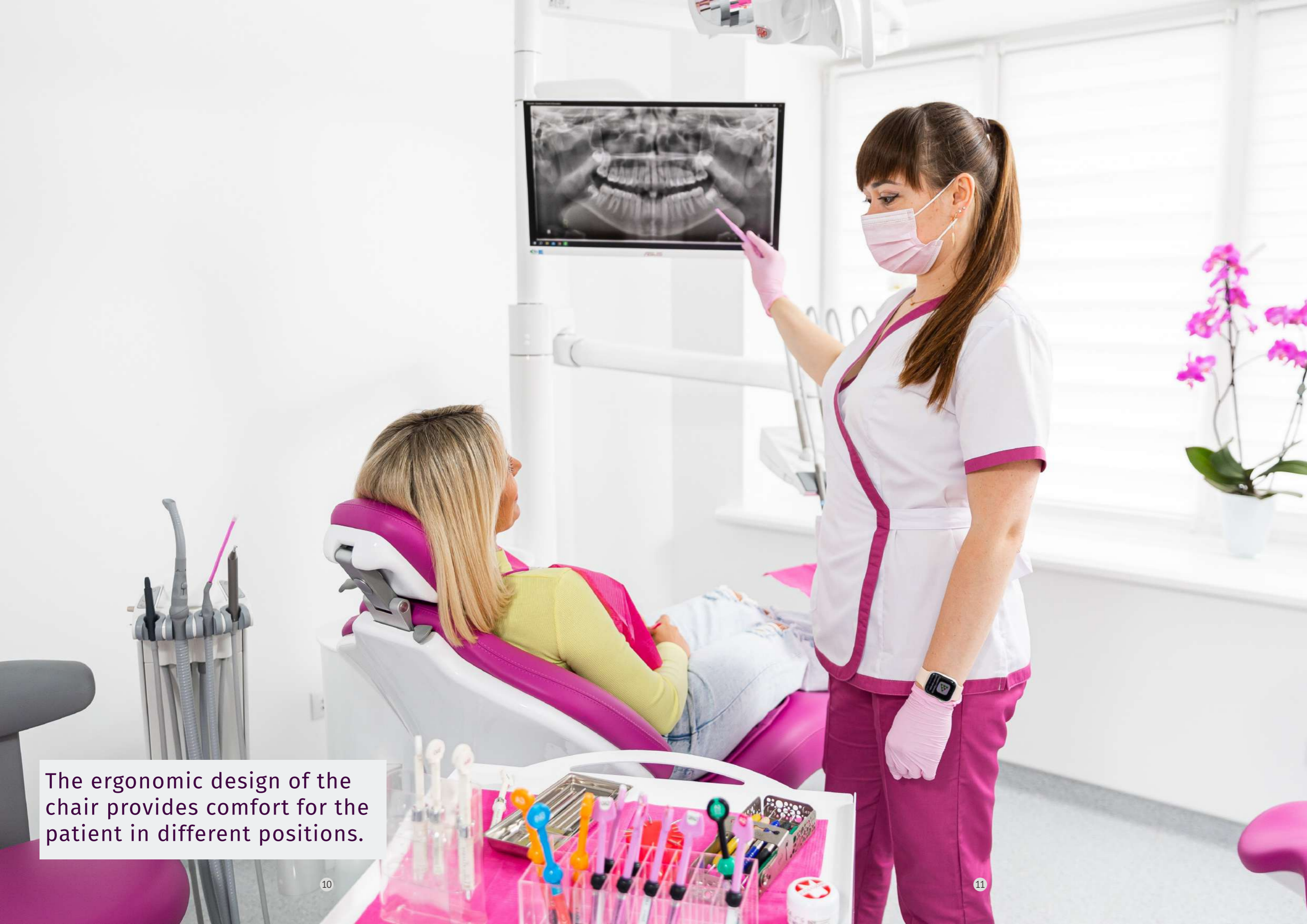
The ergonomic design of the chair provides comfort for the patient in different positions.