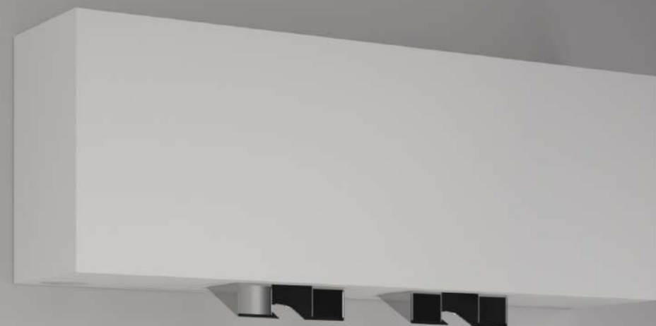
Assistant console with four instruments.

Ceramic cuspidor bowl of rotary type with flushing and electronic control of cup filling with water.