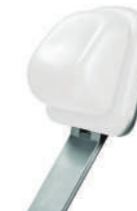
Elle E C95 Bianco